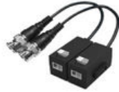
PFM800-E Passive HDCVI Balun