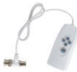
PFM820 UTC Controller